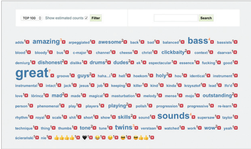
Figure 2: Word cloud extracted from the comments associated with a YouTube video.